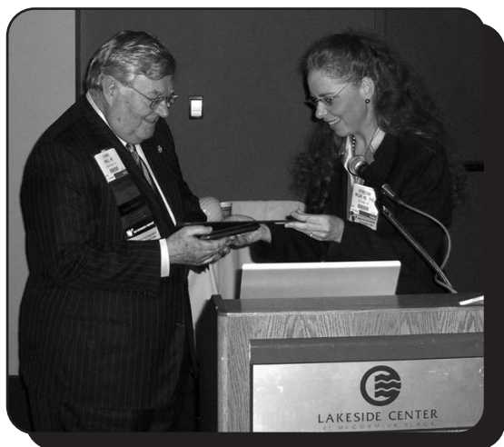
The 2005 President's Award