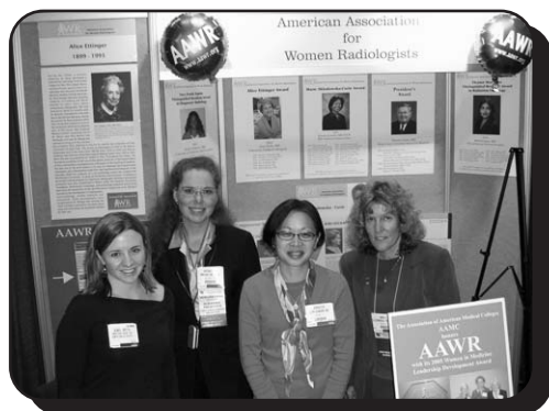
At the RSNA booth