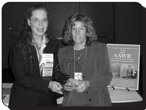
The AAMC Award