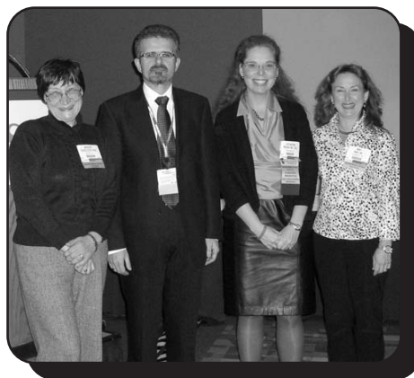
The AAWR Sponsored Refresher Course at RSNA